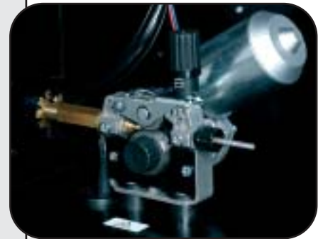
large (Ø37 mm) drive roll